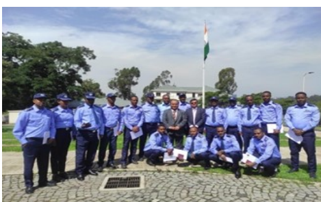
Ambassador interacted with 20 officers from Oromia Police College who left for India to attend a short training course in Gandhinagar (29 June). Their training is fully