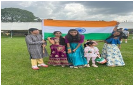
India at Bingham Academy – International Day (12 May)