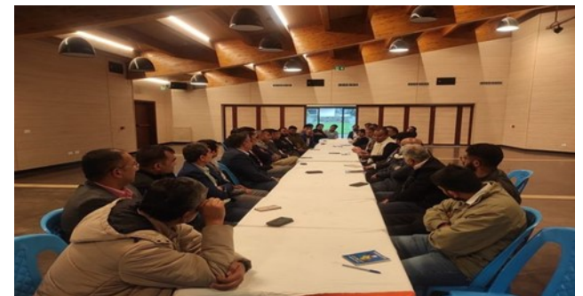
Discussion of welfare issues of the community (24 Aug)