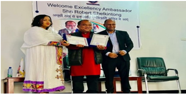
Infolink University in Hawassa (23 Sept)