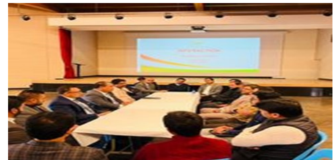
Plastic sector – interaction (22 July)