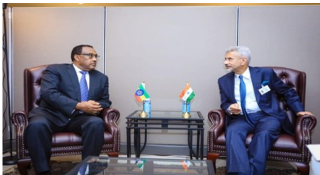
External Affairs Minister H.E. Dr. S. Jaishankar meeting with Deputy Prime Minister & Foreign Minister of Ethiopia H.E. Mr. Demeke Mekonnen in New York (20 Sept 2022)