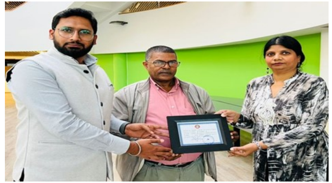
Donation of books to Abrehot library by Embassy and Reliable Books (22 Sept)