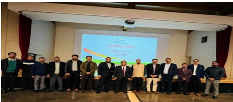
Logistics sector – interaction (14 July)