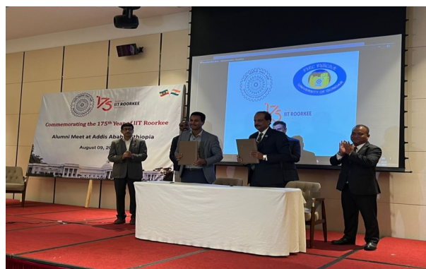
IIT Roorkee@175 celebrations in Addis Ababa (9 Aug)

H.E. Smt. Anupriya Patel, Hon'ble Minister of State for Commerce & Industry met H.E. Mr. Melaku Alebel, Hon'ble Minister of Industry of Ethiopia in New Delhi (19 July 2022). They discussed on strengthening our strong and deep bilateral relationship with a focus on enhanced economic cooperation and bilateral engagement.