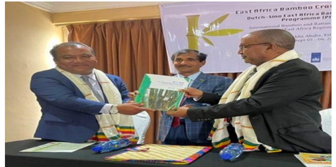
East Africa Bamboo Cross Learning workshop in Addis Ababa (5 Sept)