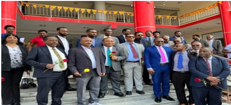
Harambee University in Adama (9 Sept)