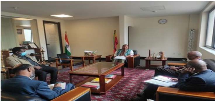
Delegation from Unity University (8 Aug)