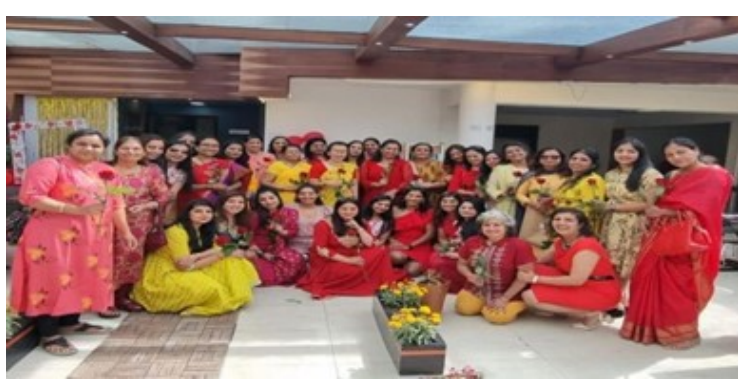
Basant Panchmi was a fun filled afternoon of good food, fun and games (12 Feb). The event was held at Chillies Addis restaurant.