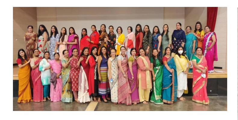
IWA regularly conducts events for its members. Come, join us!