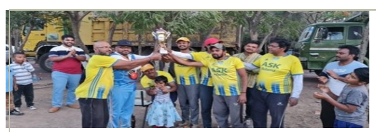
teams participated in the tournament and Debrezeit 19 March) - 64 golf enthusiasts participated in the Lions emerged as the champions.

Addis Lions had scored 137 runs and Bole Super Kings missed by 2 runs. Debre Birhan secured the third place defeating Hawassa Lions.