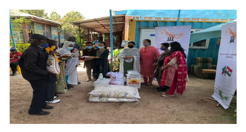
IWA donated 100 kgs rice, 40 kgs pulses, 20 kgs sugar, 10 kg salt and 20 liters cooking oil to Kibre Aregawuyan Megbare Senay Direjit, Bole Bulbula (1 Feb).