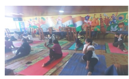
Free yoga class at Indian Spice restau- Free Indian Dance class at Embassy Free yoga class at Embassy every rant every Sunday (9-10 AM)