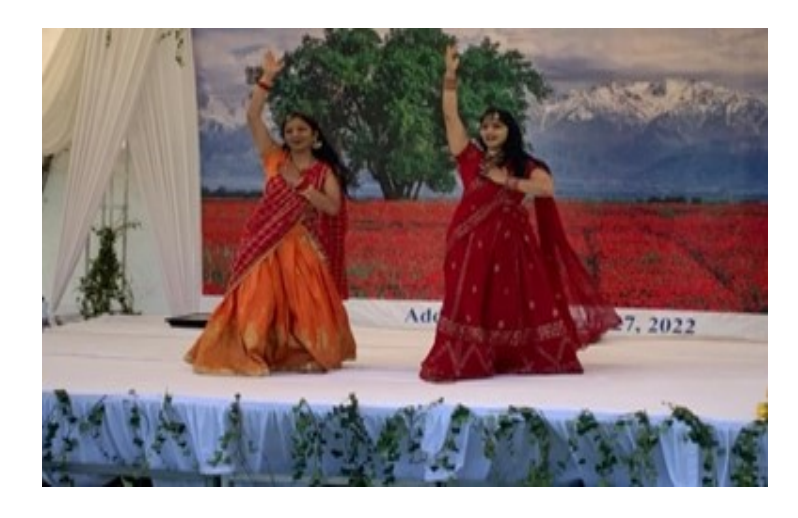
IWA participated at Nowruz celebrations in Addis Ababa (27 March)