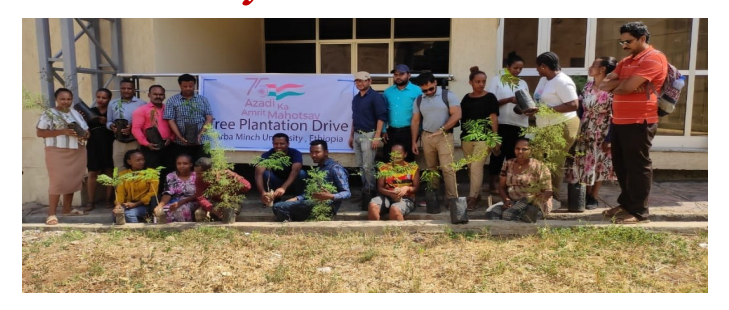
Tree Plantations were held at FDRE Defense Forces Club, Gambella University and Arbaminch University.