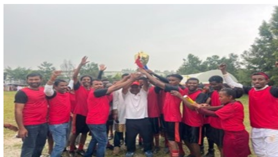
Sports Day at Ashton Apparels (9 Sept)