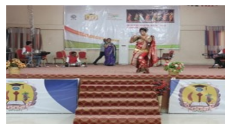
ICCR sponsored the visit of a Lavani group to Ethiopia (26-29 Nov). The group gave performances in Addis Ababa, Adama and Ambo. They also conducted workshops/lec-dem in two schools in Addis Ababa and two schools in Adama.